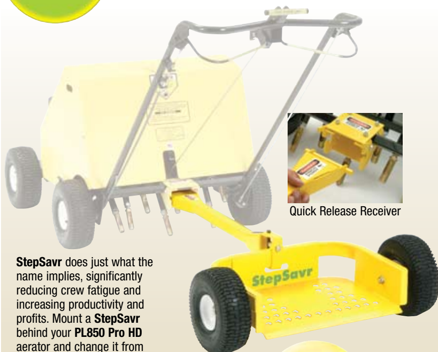
Quick Release Receiver

StepSavr does just what the name implies, significantly reducing crew fatigue and increasing productivity and profits. Mount a StepSavr behind your PL850 Pro HD aerator and change it from walk-behind to comfortable and safe ride-behind operation. The special receiver hitch mounts to the aerator frame in less than five minutes and permits quick release removal when not in use. A unique compound swivel knuckle allows maximum maneuverability and stability even on uneven terrain. With a 31" wheel base, 10" pneumatic tires and a stable, non-skid platform, your crew will love the ride.